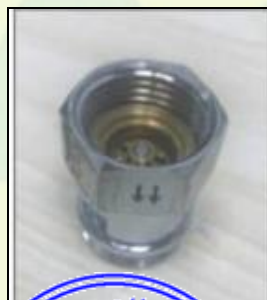
Figure 1: Photograph of test sample